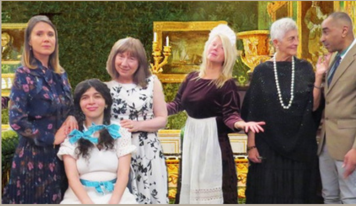
The ESU Players presentation of The Chalk Garden by Enid Bagnold

All performances are held at 144 East 39th Street, NYC