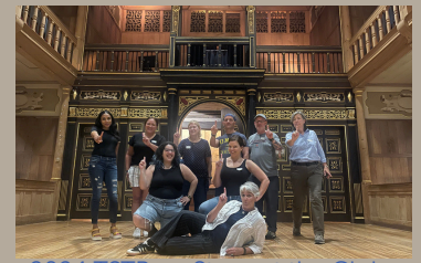
2024 TSTP on Stage at the Globe