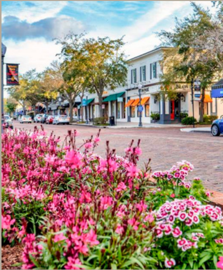
Winter Park, Florida Downtown