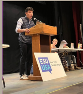
Demo Debate at Novice Workshop